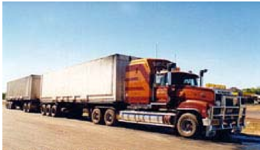
17-Point Tractor & Trailer Inspection